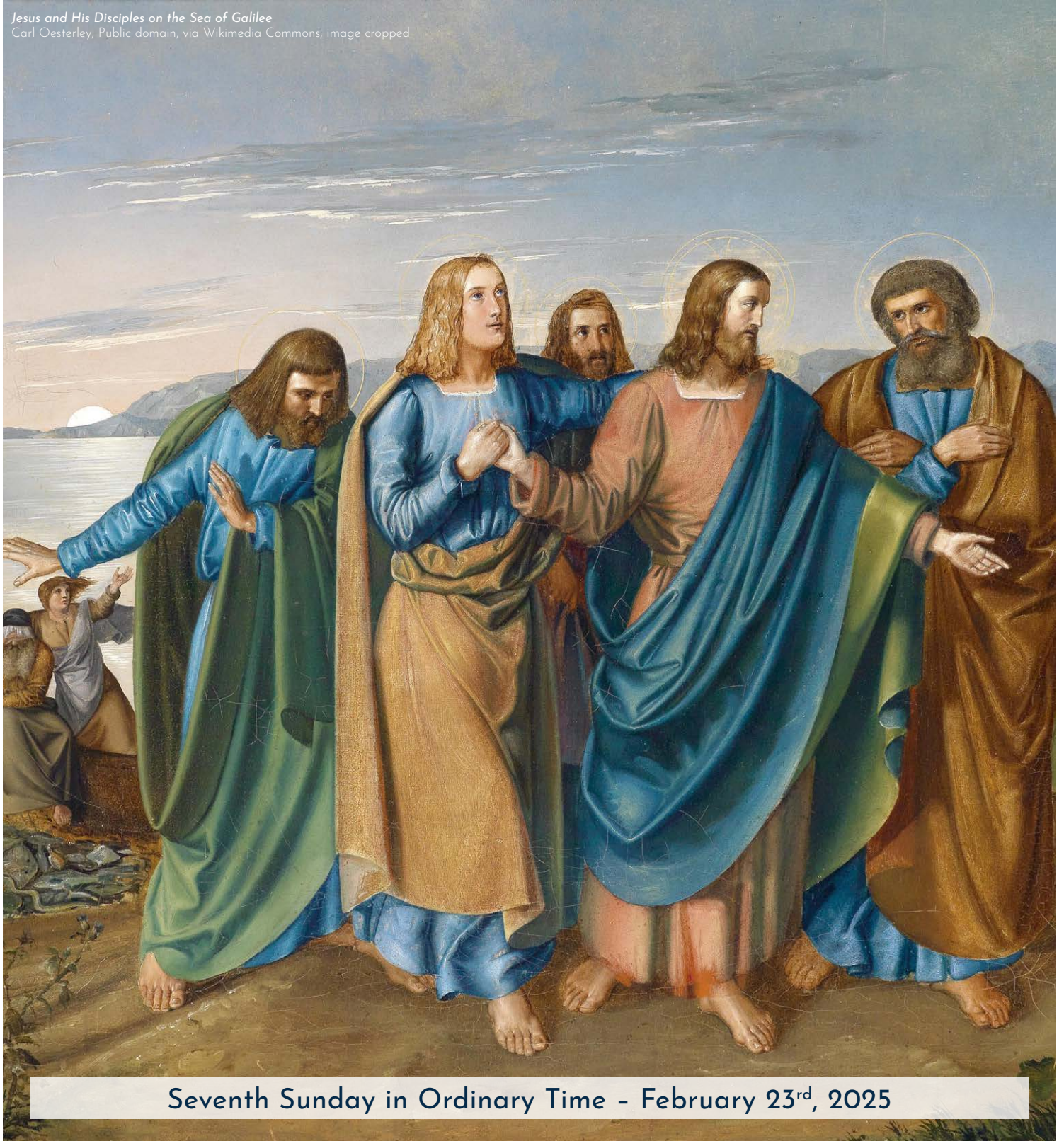
Jesus and His Disciples on the Sea of Galilee

Seventh Sunday in Ordinary Time - February 23 rd , 2025