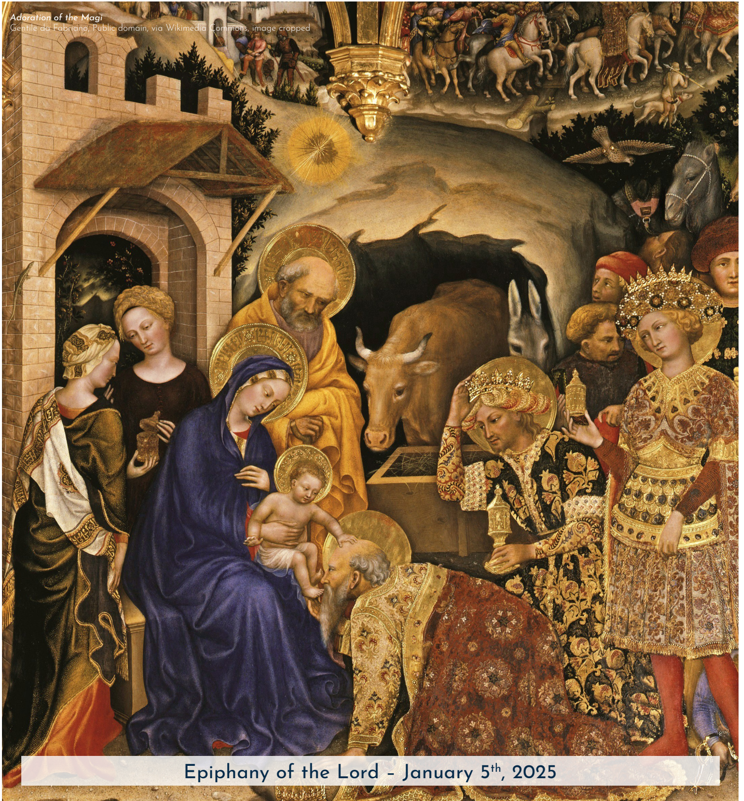
Adoration of the Magi Gentile da Fabriano

We exist to offer the life-giving intimacy of Jesus to the hurried, lonely, and lost.